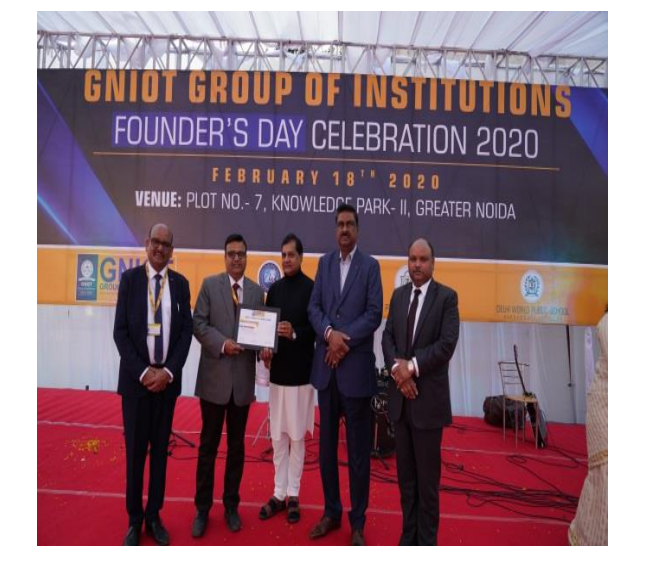
Award Category: Research Publication