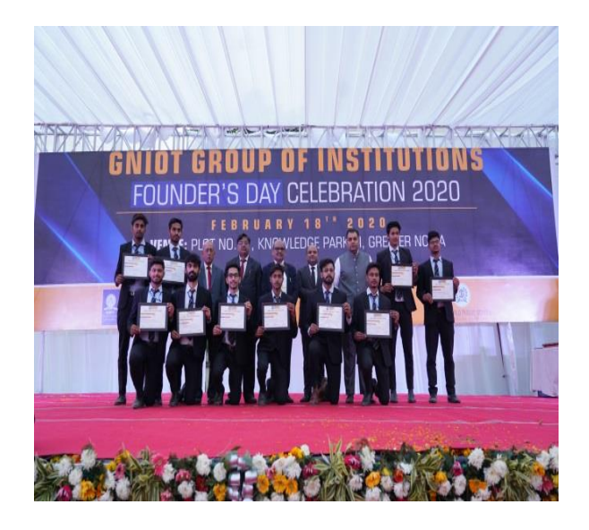
Award Category: University Rankers