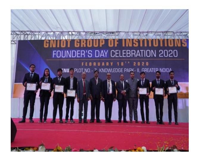
Award Category: Sports Achievement