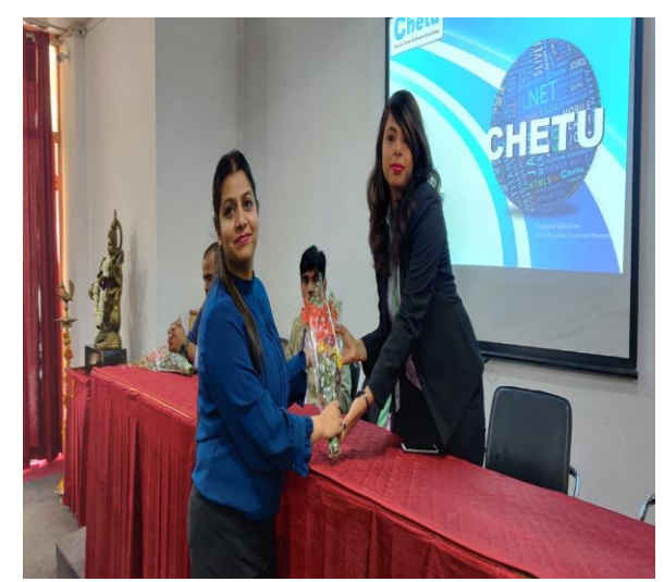
passion for excellence to deliver enterprise- grade solutions.

Chetu is a US-based software development company that provides businesses worldwide with custom technology solutions. As an application development company with over 1,800 skilled software developers, Chetu combines technological expertise, specific domain experience, and