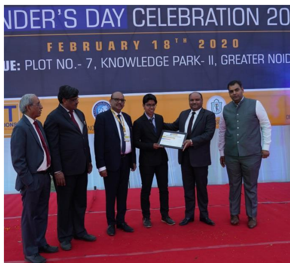
Award Category: Sports Achievement