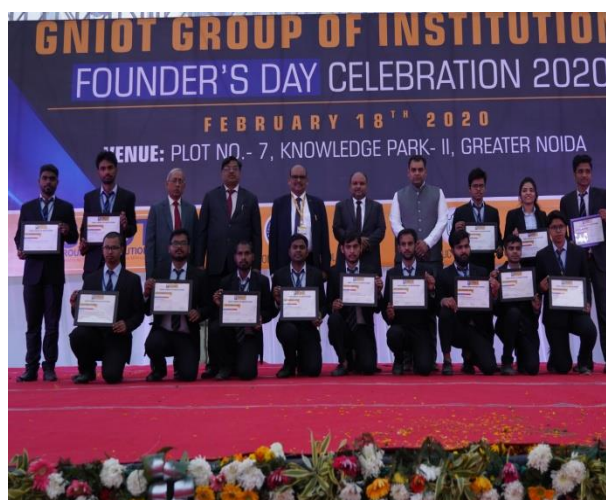
Award Category: Best Attendance Award (2018-2019)