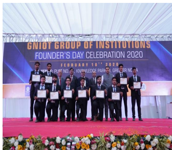
Award Category: Helping Hand Award