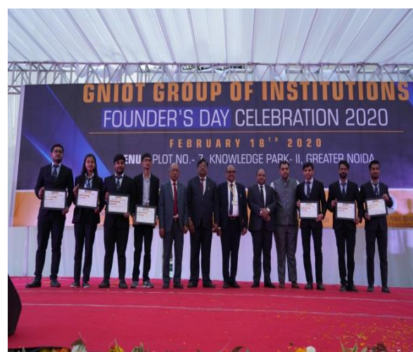
Award Category: Cultural Achievement