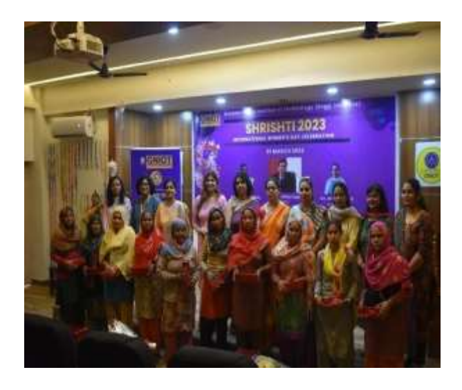
Felicitation of the lady supervisors

On the occasion, CPRC awarded the 10 best lady supervisors for their continuously support given to GNIOT campus.